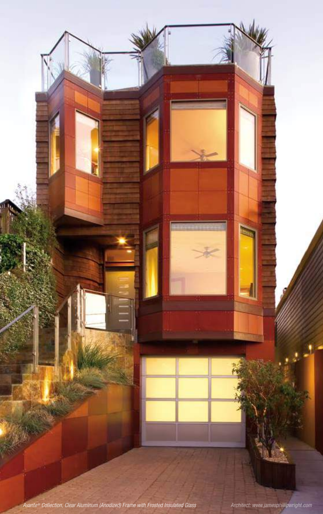
Avante® Collection, Clear Aluminum (Anodized) Frame with Frosted Insulated Glass