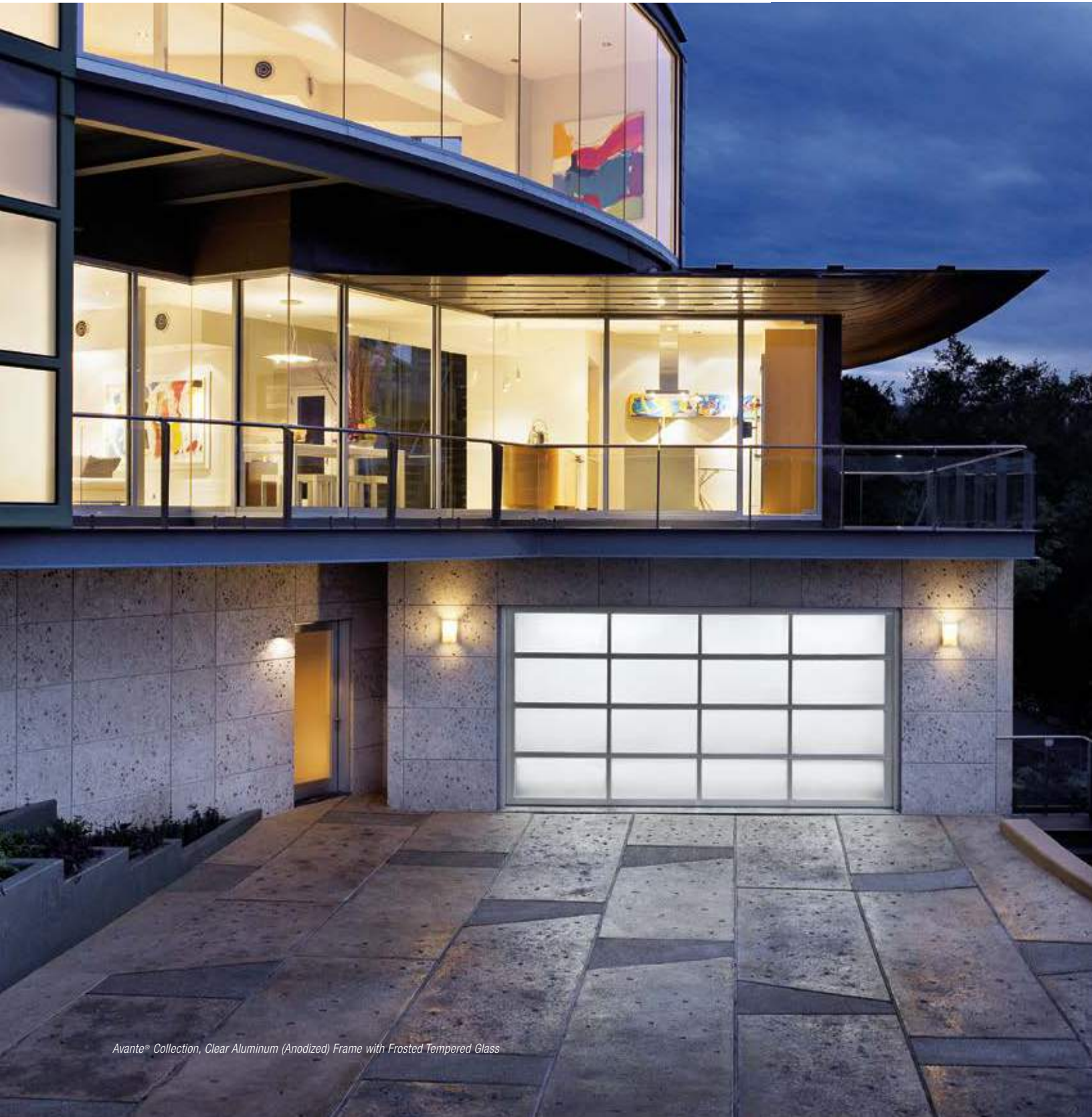
Avante® Collection, Clear Aluminum (Anodized) Frame with Frosted Tempered Glass