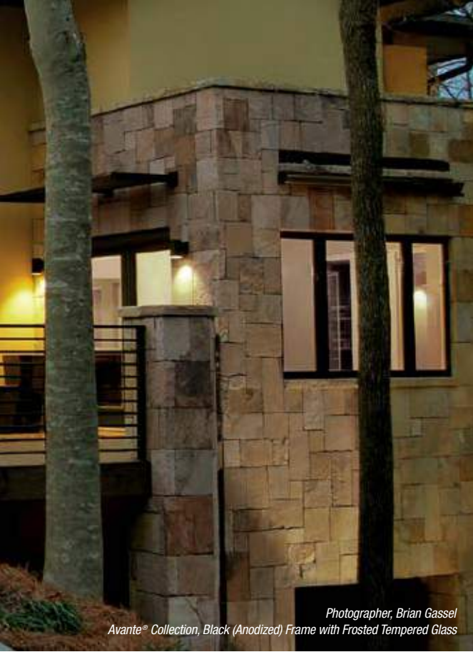
Avante® Collection, Black (Anodized) Frame with Frosted Tempered Glass