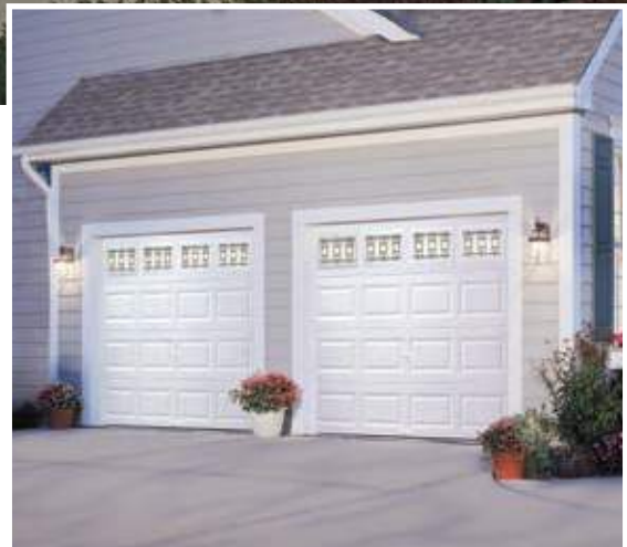
Model T42S, Short Traditional Panel with Optional Short Trenton® Window Design