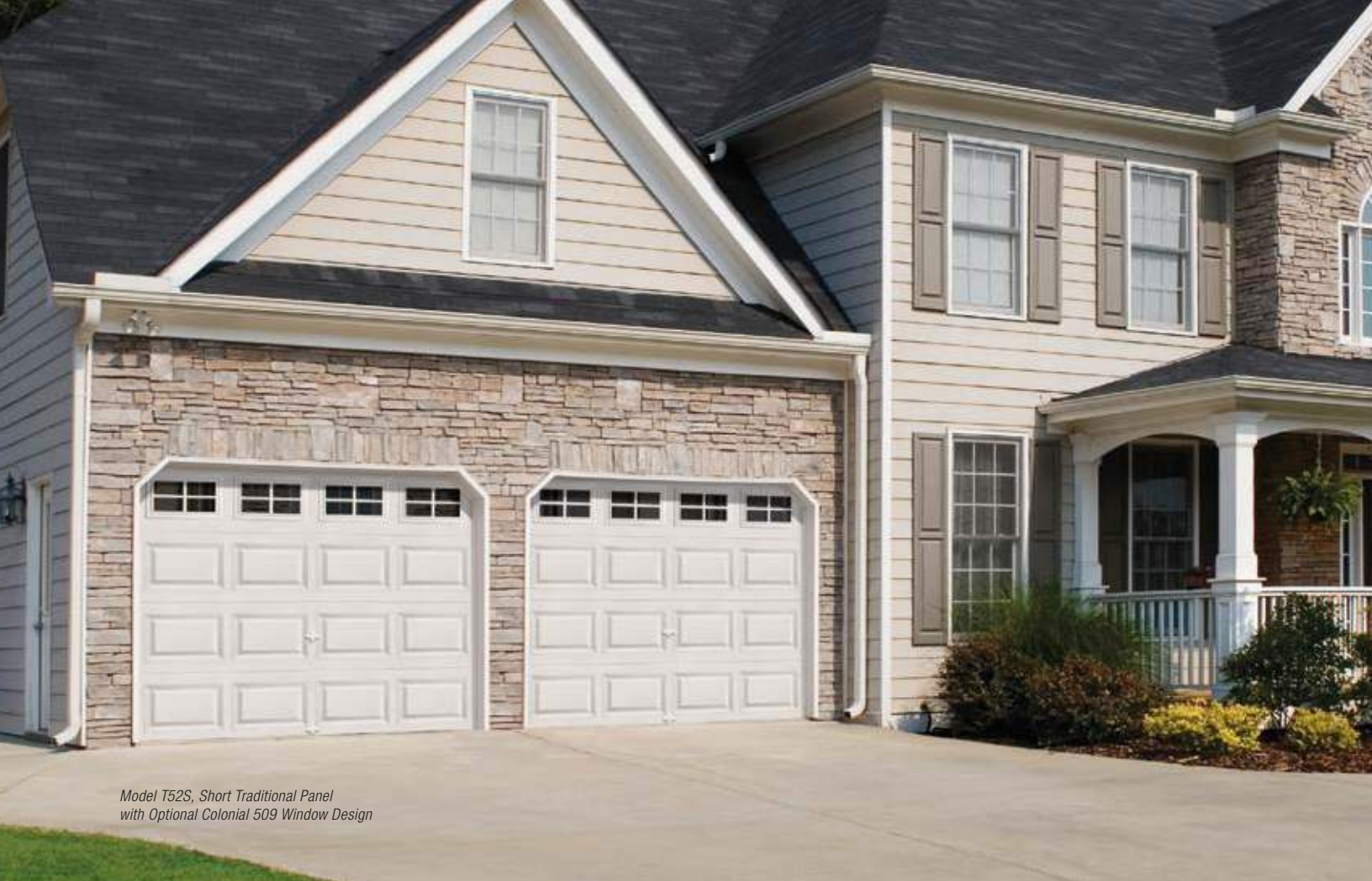
Model T52S, Short Traditional Panel with Optional Colonial 509 Window Design