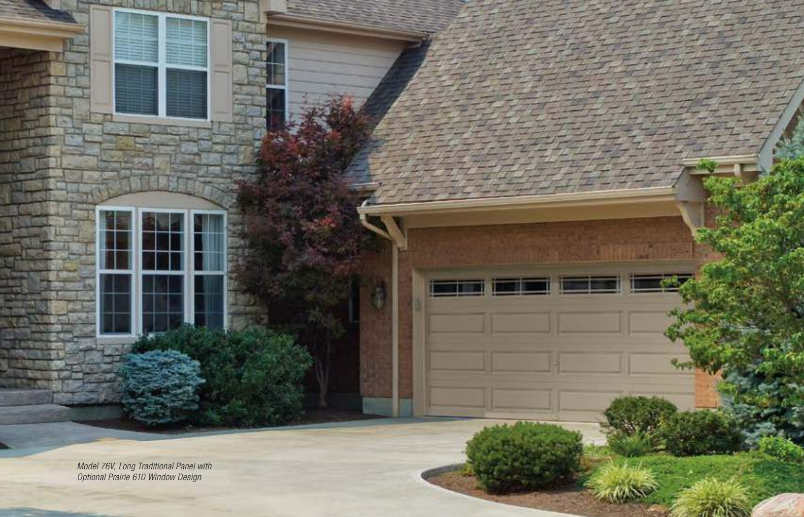
Model 76V, Long Traditional Panel with Optional Prairie 610 Window Design