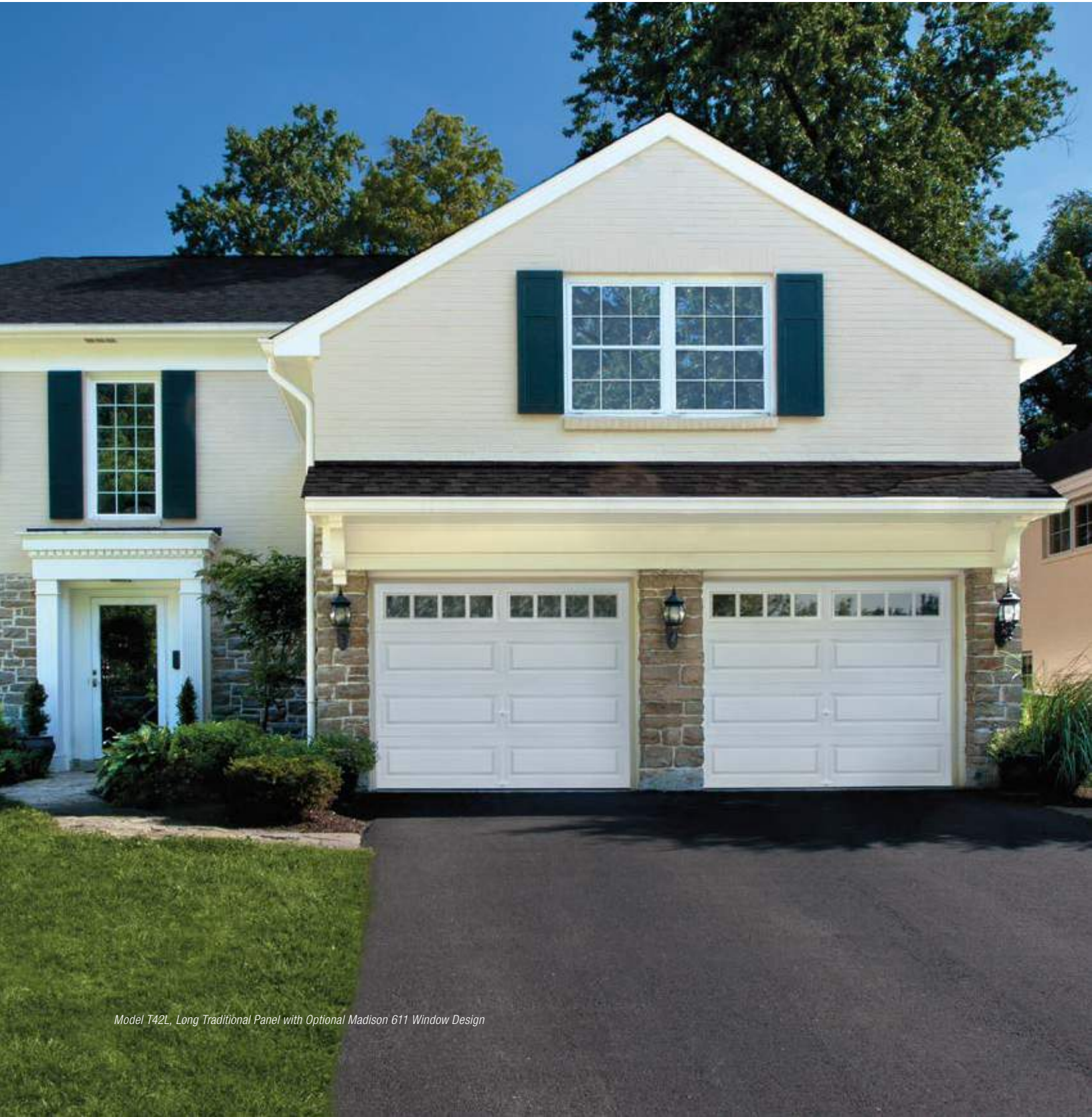
Model T42L, Long Traditional Panel with Optional Madison 611 Window Design