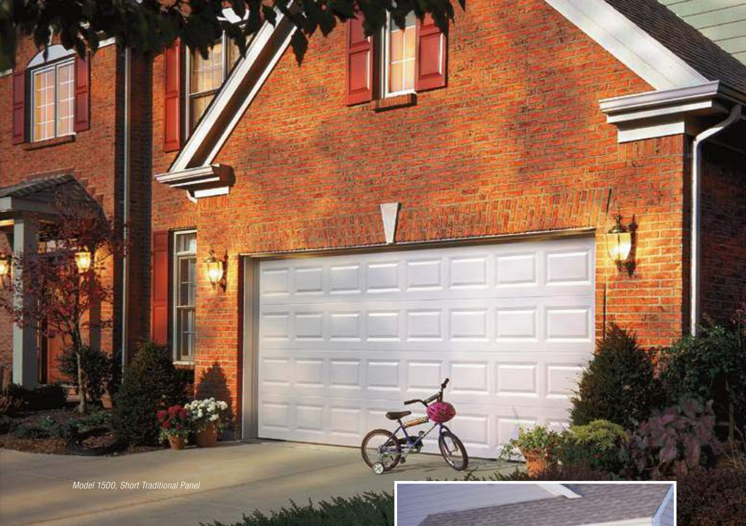
Model 1500, Short Traditional Panel