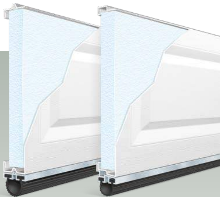
Tongue-and-Groove Section Joints