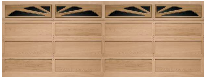
Horizon (16' Wide)