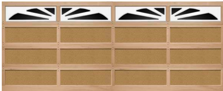
Sunset (16' Wide)