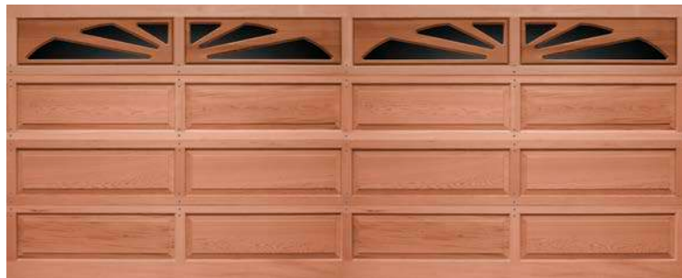
Horizon (16' Wide)