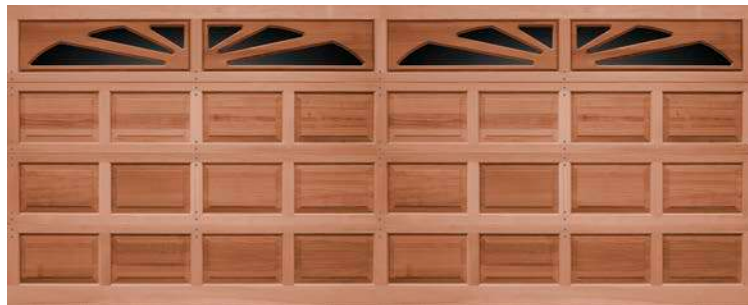
Horizon (16' Wide)