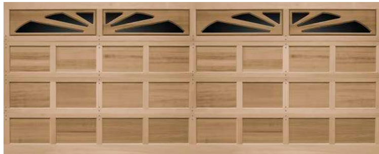
Horizon (16' Wide)